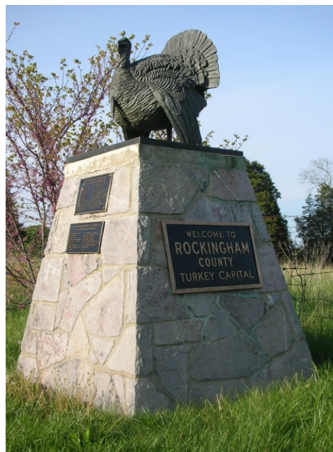
Turkey Capital, Rockingham County