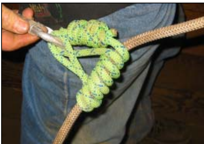
(Sewn leg loop)

On longer rappels of 300 feet or more, here is another tip. The weight of the rope itself at 7 pounds per 100 feet can be used to pin the French Wrap in a released position below the hip with the tail of the rope going over your right hip. This allows you to use both hands to work the rack adjusting bars, or to add and subtract bars on the run without stopping the rappel on a hot rack. Usually I will use a foot control method by hooking the tail of the rope around my right boot when doing this. This worked very well on my rappels at Guaguas (700'), Bridge Day (800'), and Golondrinas (1200').