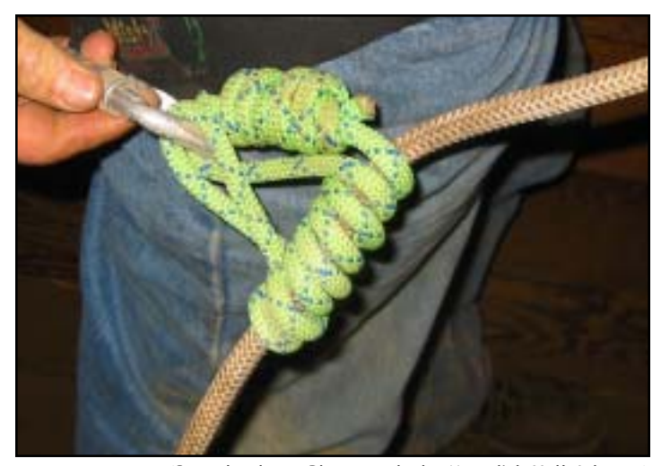
(Sewn leg loop)

On longer rappels of 300 feet or more, here is another tip. The weight of the rope itself at 7 pounds per 100 feet can be used to pin the French Wrap in a released position below the hip with the tail of the rope going over your right hip. This allows you to use both hands to work the rack adjusting bars, or to add and subtract bars on the run without stopping the rappel on a hot rack. Usually I will use a foot control method by hooking the tail of the rope around my right boot when doing this. This worked very well on my rappels at Guaguas (700'), Bridge Day (800'), and Golondrinas (1200').